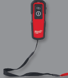
Remote for MX FUEL™ Concrete Vibrator (3701 / SPECIAL ORDER)