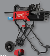
MX FUEL™ Pipe Threading Machine Kit (MXF512-2XC / 4511335)