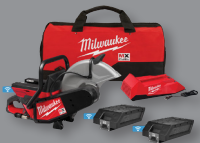
MX FUEL™ 14" Cut-Off Saw Kit (MXF314-2XC / 4511100)