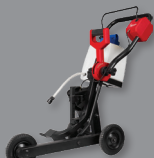
Cut-Off Saw Cart (3100 / 4511110)