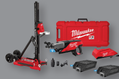
MX FUEL™ Handheld Core Drill Kit w/ Stand (MXF301-2CXS / 4511140)