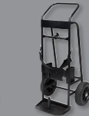
Demolition Breaker Cart (3600 / 4511210)