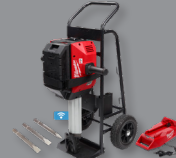
MX FUEL™ Breaker Kit (MXF368-1XC / 4511200)