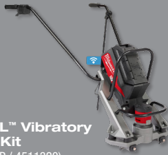
MX FUEL™ Vibratory Screed Kit (MXF381-2CP / 4511320)