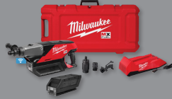
MX FUEL™ Handheld Core Drill Kit (MXF301-2CP / 4511130)