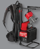
MX FUEL™ Backpack Concrete Vibrator Kit (MXF371-2XC / 4511330)