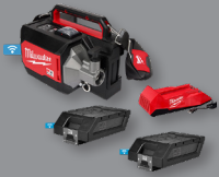
MX FUEL™ Concrete Vibrator Kit (MXF370-2XC / SPECIAL ORDER)