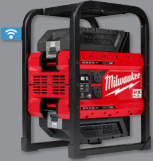
MX FUEL™ CARRY-ON™ 3600W/1800W Power Supply (MXF002-2XC / 4511040)