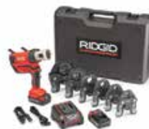
RP 350 KIT Cat. #67053 SKU: 6519045