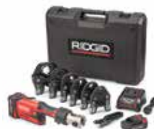
RP 351 KIT Cat. #67178 SKU: 6519055