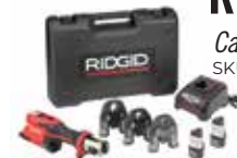
Cat. #78158 SKU: 6519036