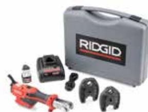
Cat. #72553 SKU: 6519005